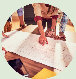
Writing a Business Plan