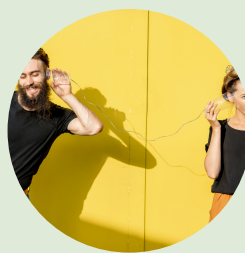
Marketing and Communication