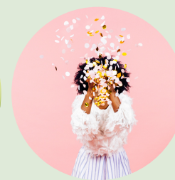
Project Idea Design

These modules are available on the project platform - get ready to transform your business vision and make a difference in the world with sustainable business! 🌱📁